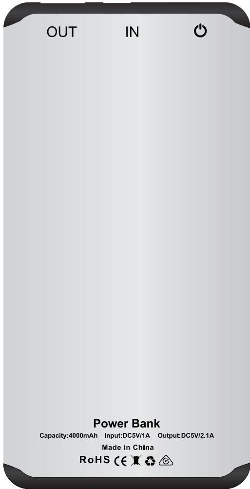
Front - USB END