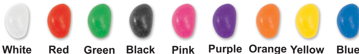
White Red Green Black Pink Purple Orange Yellow Blue

Statutory ingredients information and best by date are pre-printed directly on the cello bags