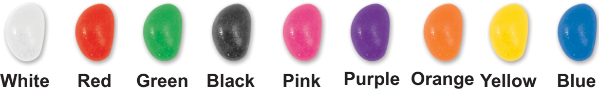
White Red Green Black Pink Purple Orange Yellow Blue

Blue line shows maximum print area for copy and logo's. At least 3mm of bleed is required for full reversal artworks - represented here by the Green dotted line.