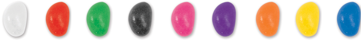
White Red Green Black Pink Purple Orange Yellow Blue