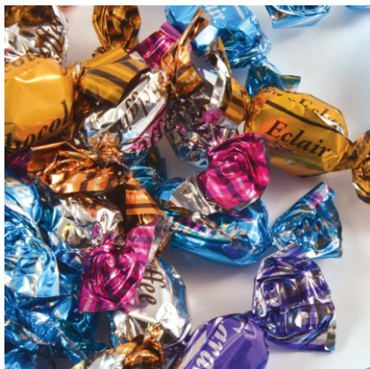
Fill - Mixed Eclairs

Product Code : LL1070 Description : Mixed Eclairs (Chocolate, Hazelnut, Coffee, Caramel) Item Colour/s : Clear/Assorted Quantity : Decoration Type : Undecorated