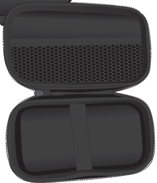
Open view show @ 50% of actual size

Maximum print area: 100mmL x 50mmH Actual print size: