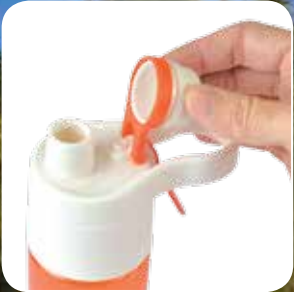
Screw Lock Cap