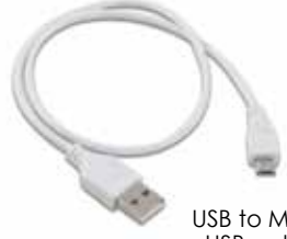
USB to Micro USB cable included