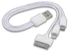
3 in 1 cable included