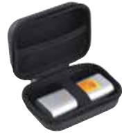
Optional Zippered Case