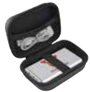
Optional Zippered Case