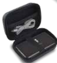
Optional Zippered Case