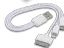
3 in 1 cable included