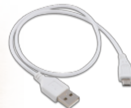
USB to Micro USB cable included