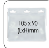
Business Card Holder 105 x 90 (LxH)mm