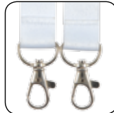
Dual Metal Clips