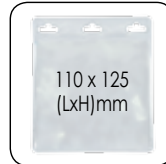
Name Badge Holder 110 x 125 (LxH)mm