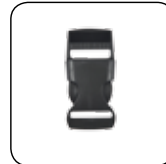
Plastic Buckle 15mm, 20mm, 25mm