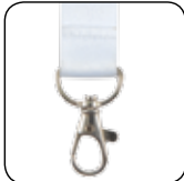
Single Metal Clip