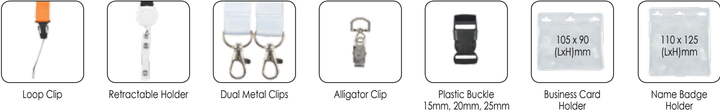
Loop Clip Retractable Holder Dual Metal Clips Alligator Clip Plastic Buckle 15mm, 20mm, 25mm Business Card Holder 105 x 90 (LxH)mm Name Badge Holder 110 x 125 (LxH)mm

Optional Extras – choice of single or dual clips available.